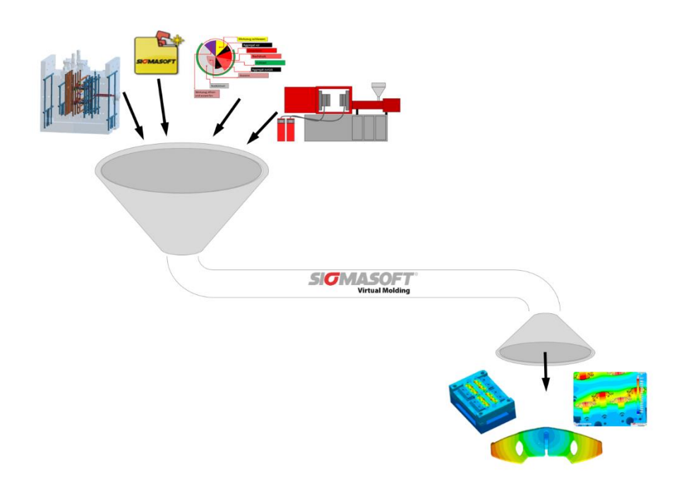
Figure 1 – With conventional approaches for injection molding simulation the user provides a combination of geometries, materials and process set-up and receives a result for this specific point inside the process window

In 2018 SIGMA Engineering exhibits for the first time at Plast show with their own booth. During the show it presents its SIGMASOFT® Virtual Molding technology and the new Autonomous Optimization to the Italian market. The Autonomous Optimization brings out a completely new simulation approach to optimize plastic and rubber applications.